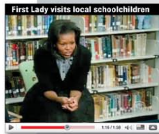
First Lady visits local schoolchildren

It's nearly as easy to produce Web-quality video as it is to shoot still photographs. In fact, on many assignments, photojournalists routinely shoot both video and photos. Like photos, videos can supplement text or run independently in galleries.