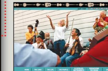
Photo slide shows focus on the land, the life, the musicians and ordinary folks along the way.

Videos capture the sights and sounds as you drive from town to town, including music from this concert by bluegrass legend Ralph Stanley.